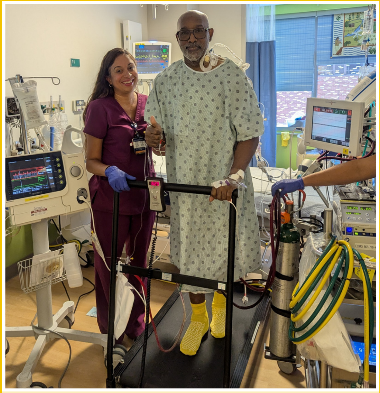
Walking on treadmill with VA-ECMO via bilateral femoral access and percutaneous ventricular assist device via right axillary access

Division of Pulmonary and Critical Care Medicine, and Department of Physical Medicine & Rehabilitation present: